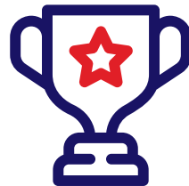
AI Anti-fraud Solution