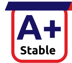
Standard & Poor's