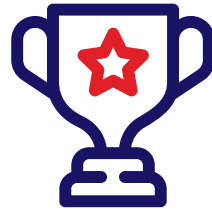
Video Interaction Technology