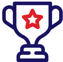
Motor Claims Concierge Service